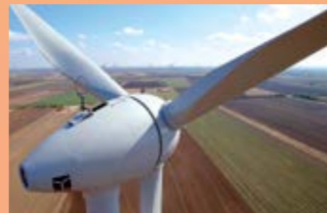
► Wind industry