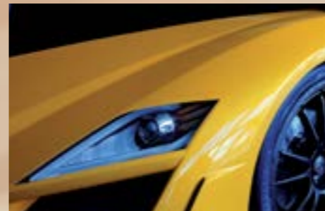
► Automobile industry