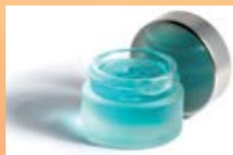
Small or Micro-Parts